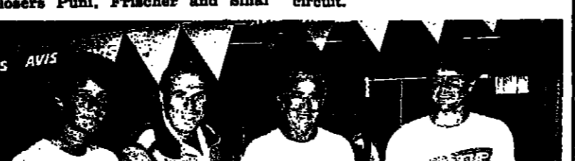
Two generations of Israel Davis Cup players met at the Tel Aviv Country Club last week for the final of the second annual Avis Cup championship for tourism personnel.